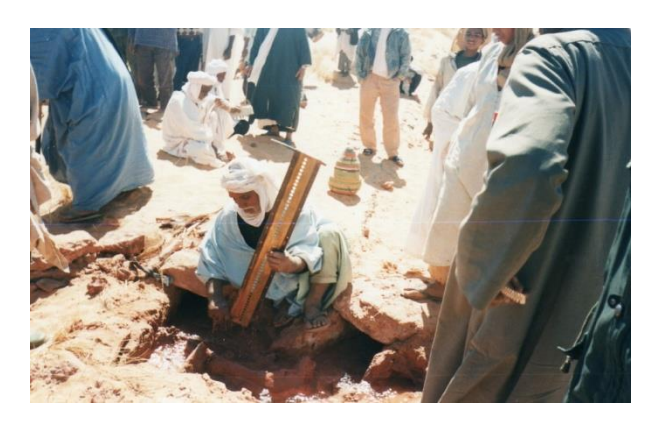
Figure 4. Operation of measurement using chekfa.

placed just at the exit of the canal to bar the incoming flow and to form a small basin (fig 4). Once the water level in the basin reaches overflow, several holes were unblocked until the equilibrium had been established; in other words, the amount of water that comes into the chekfa from the canal, and the amount of water the goes out through orifices that we opened gradually are considered to be the same amount only if the water level in the basin stays stationary. This equilibrium can be known through indicators engraved on the chekfa plate [12]. The number of holes was then counted to know the water flow entering. Finally, measures were recorded in a note book (zemam) by using the local symbols (|\cdot|, +, \bullet, \bullet, \bullet, +, \bullet, \cdot, \cdot, \cdot, \cdot, \cdot, \cdot, \cdot, \cdot, \cdot, \cdot, \cdot, \cdot, \cdot) which are used by the local inhabitants.