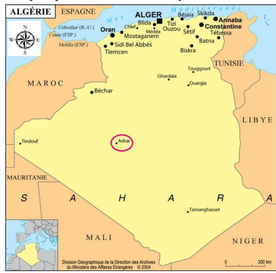
Figure 2.Location of the study area.

Adrar region, located approximately 1,500 km southwest of Algiers (Fig.2); [10], covers an area of 525,270 km² which represents 1/5 of national territory. This region is defined by latitude 0°30' W to 0°30' E and longitude 26°30' N to 28°00 N with an altitude of 280m above MSL [6]. Its natural boundaries are the Greatest Western Erg to the North, the Erg Echech to the West, the Tanezrouft Sahara to the South, and the Tademaït plateau to the East [8]. Touat and Gourara is a hyper arid region, with precipitations below 15 mm/year.